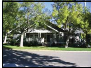
ELBOW PARK Offered at 1,879,000