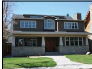
ELBOW PARK Offered at $2,895,000