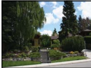
ELBOW PARK Offered at $1,149,000

3119 Carleton Street SW • Offered at $1,225,000 • Represented Seller 827 Prospect Avenue SW • Offered at $2,595,000 • Represented Seller & Buyer 3404 8a Street SW • Offered at $2,795,000 • Represented Seller