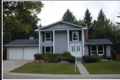
Bel Aire – $1,580,000