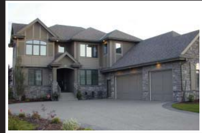
Wentworth Estates – $1,688,000