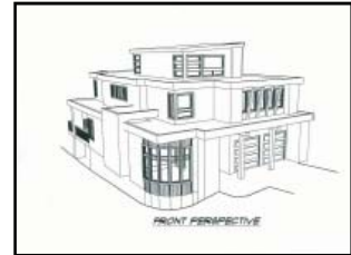
ELBOW PARK Offered at $2,950,000

MOUNTAIN SPIRIT RESORT & SPA KIMBERLEY • BRITISH COLUMBIA