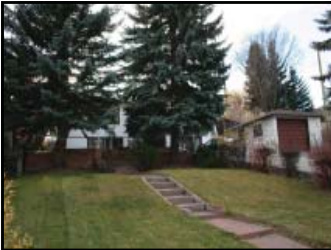
MOUNT ROYAL Offered at $895,900