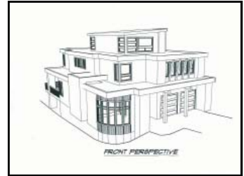
ELBOW PARK Offered at $2,950,000