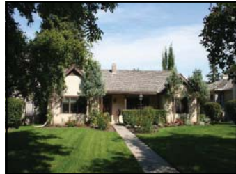
MOUNT ROYAL Offered at $1,195,000