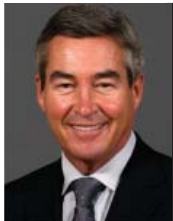
Lee Richardson Member of Parliament Calgary Centre